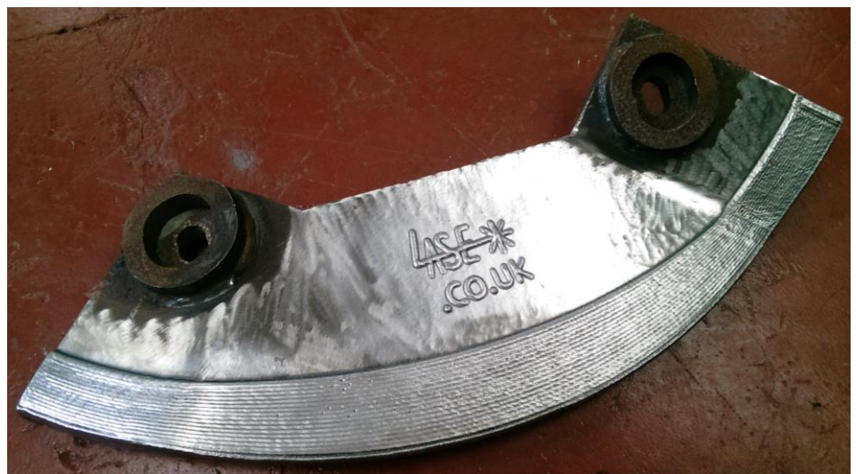
A Laser Clad Scroll Segment prior to service